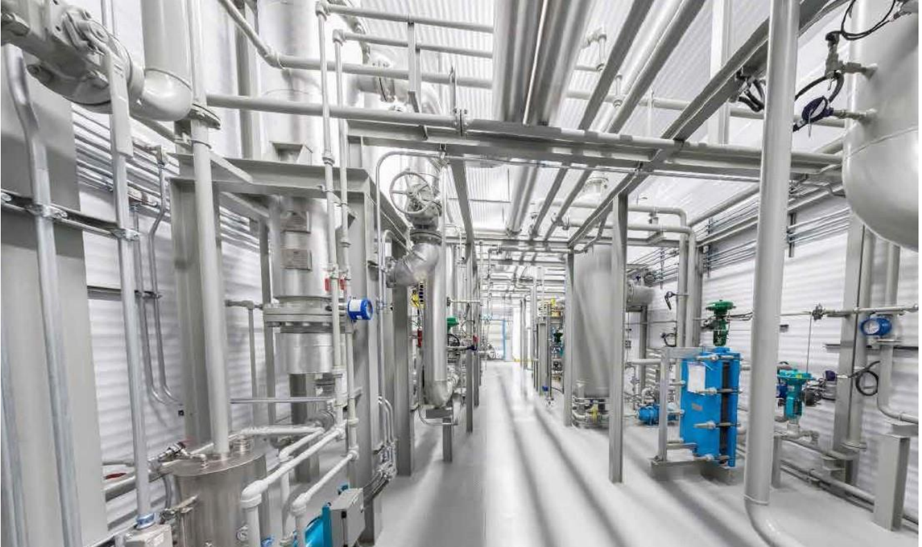
Modular designed CO 2 capture unit, designed by Delta