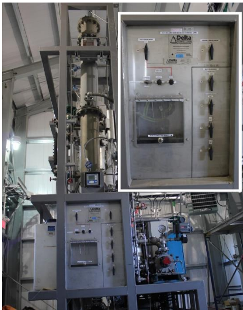
Delta Reclaimer® attached to the CO 2 Capture system at the Husky Energy Plant in Lashburn, SK

The patented Delta Reclaimer® is being used in countries all over the world to provide a reliable solvent and glycol reclaiming system that allows polluted fluids to be reclaimed, recycled and returned to the plant in “like new” status. There is a growing demand by industries to meet ESG standards and the expectation of the safe handling of industrial wastes by recycling these fluids instead of disposing of them in underground disposal wells, thereby protecting the earth from large volumes of toxic and degraded chemicals.